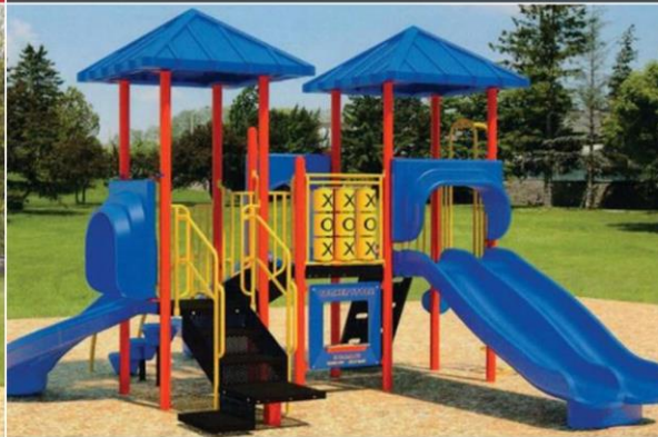
H1697BAC Use zone: 24' x 38' Approx $24,500