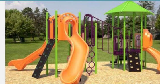
H2539OD Use zone: 26' x 38' Approx: $22,890