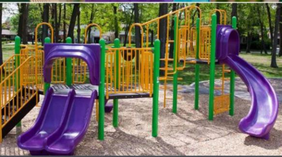
H352 Use zone 31' x 32' Approx: $14,200