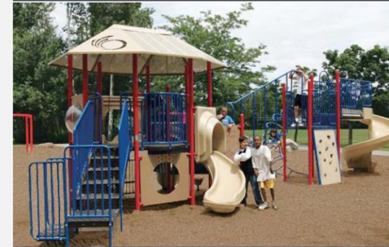
H344 Use Zone: 36' x 52' Approx: $23,999