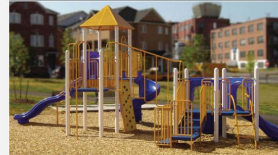
H545 Use zone: 32' x 45' Approx: $17,900