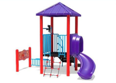
H726 Use zone: 23' x 25' Approx: $6,900