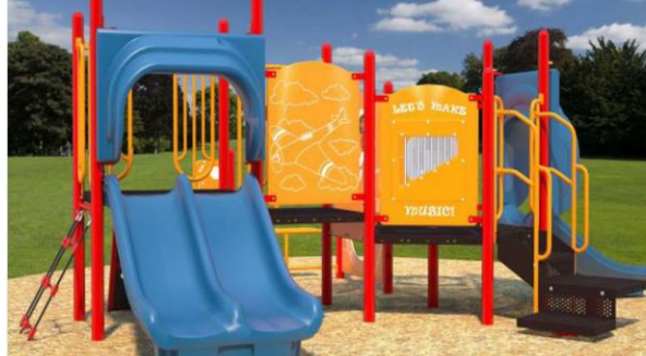
H3830 PP Use zone: 31' x 27' Approx: $14,950