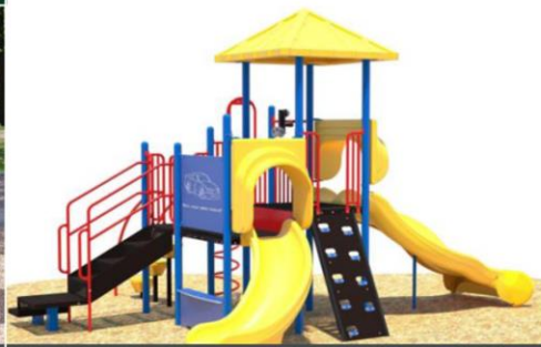
H2732 Use zone 30' x 33' Approx: $14,500