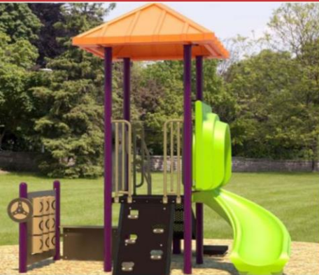
H1608 Use zone: 24' x 25' Approx: $7,100

Our installation service takes care of every aspect of the job, from removing existing equipment to final clean up. Outside of our service areas we work with local contractors on all details.