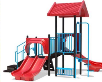
H1276 Use zone: 26' x 28' Approx: $12,400