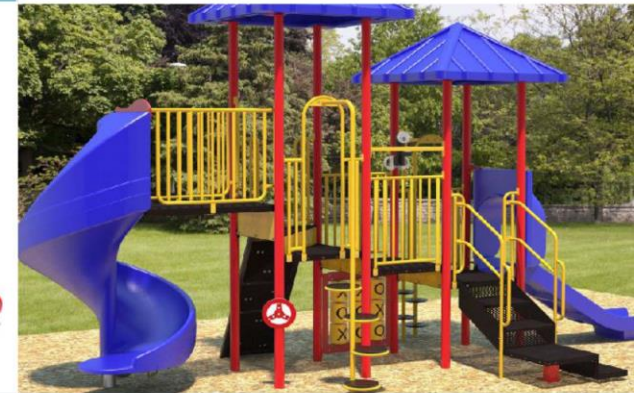
H2638 Use zone: 28' x 32' Approx: $18,800