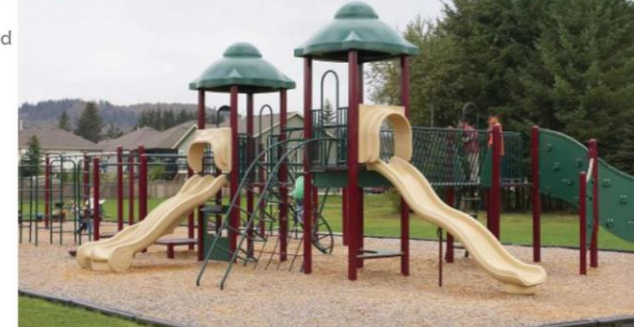
H7748SC Use zone: 43' x 64' Approx: $34,900

Furnishings we offer Bicycle Racks Tables Benches Trash Receptacles